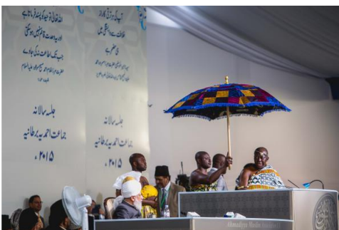
The Republic of Ghana / Ashanti Empire, Osei Tutu II (Born May 6, 1950)

Islam is roughly divided into Sunni Islam and Shia Islam. Shia Islam is 10% of the total Muslims. 1 The Ahmadiyya that invited me this time is only an imitator of Sunni Islam from the point of view of Shia Islam. 30,000 people from 90 countries participated in the Ahmadiyya “Jalsa Salana (annual conference)” that was held at the suburbs of London, the United Kingdom from August 21 to 23, 2015. Not only the King of Ghana, President of Senegal and Vice President of Sierra Leone, but also other important people from each country sent messages with quotations from the “Quran (Official name ‘Holy Quran n’)”.