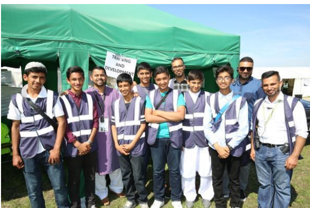
Ministrants of young people during the World Assembly

Children from participating countries were also listening to the programs from 10 am to 7pm. It is not uncommon to see well-behaved elementary school students at the gathering of Soka Gakkai, which is the biggest religion in Japan. In case of the management of the big scale of the conference, usually well experienced adults or professionals, who have years of practice, operate it. However, at the Jalsa Salana conference, the liveliest services were carried by the age group of elementary school and junior high school students. They were divided into a pair and distributed soft drinks in the venue. At the time of meal, they served to prepare foods, napkins, drinks on the table and clean up after people eating. You can tell that they were not forced to do that because their parents order to do it, when they came to your table with smiles.