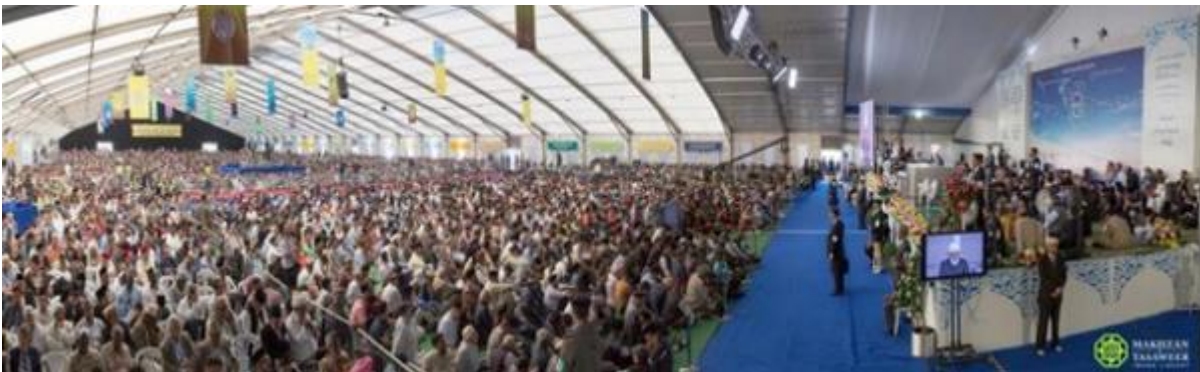
The entire hall of the Jalsa Salana where 30,000 people together.

The preconception that have been seen in every monotheistic religion, such as exclusion, intolerance and ultimatism, which are occupying religions endlessly, are deleted. It became the opportunity for each divided religions, Christianity, Buddhism, Shintoism and others to realize about insisting own legitimacy that is a foreignness which has no difference from Aum Shinrikyo.