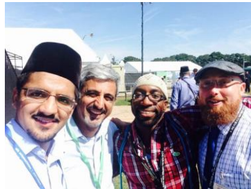
All human beings are brothers and sisters

Even under the strong hot weather, a friendly international goodwill, bright smiles and displays of orderly managements were noticeable. In Japan, despite there is a universal youth development program which is not inferior to the world, it is decreasing due to an influence of exam-preparation study and extracurricular activities in the school. Compared to the scouting activities that have begun in 1907, I was able to discover the typical Ahmadiyya key to succeed in faith at the London conference. In other words, it is the child education that would be hard to found in the historical Muslim society.