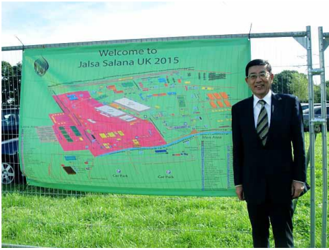
Conference venue map at the entrance